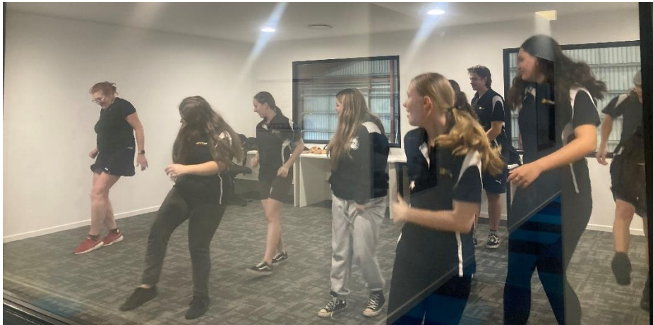
Zumba classes during elective time

Have you noticed a positive change in your teen since they started attending The BUSY Schools Cleveland? Would you like to share this with others?